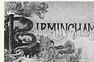
2009 Alabama Writers Conclave Conference scheduled for Birmingham

fabulous "roll up your sleeves and learn" conference, more active writers will join us. Please spread the word. We would love to recruit more members.